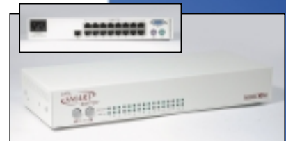
Smart CAT5 Switch, 16 Ports