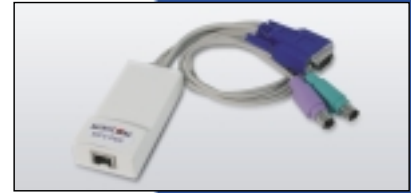
RIC PS/2 Cable (also available for SUN & USB)