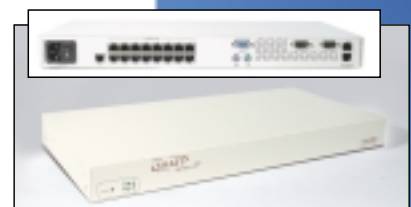
Smart 16 IP Switch