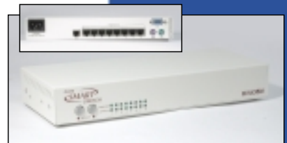
Smart CAT5 Switch, 8 Ports